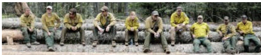
Thank you BLM Crew '08